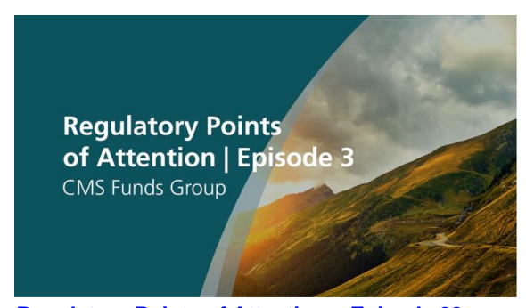
Regulatory Points of Attention - Episode 03