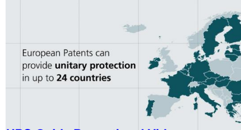
UPC Guide Promotional Video