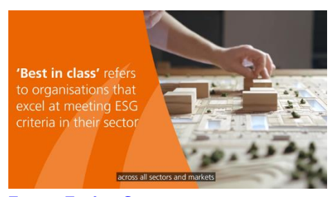
<u>Future Facing Sectors –</u> Katie Nagy De Nagybaczon