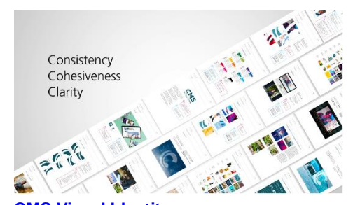
CMS Visual Identity